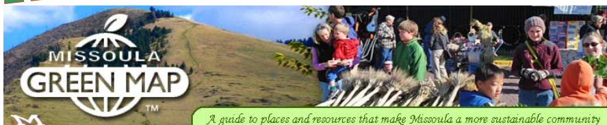
A guide to places and resources that make Missoula a more sustainable community

Are you finding it a struggle to live sustainably? Maybe you need a SUPER GUIDE to all the sustainable resources and places that Missoula offers! The Missoula Green Map was created by MUD with the help of many volunteers and sponsorship by Portico Real Estate.