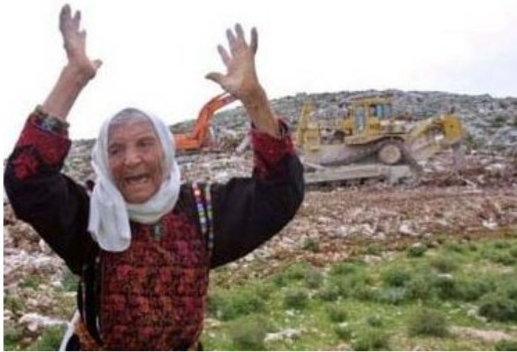
Indigenous Women Suffering From Zionist Bulldozing of Home in Modern Day Palestinian Terror-Tory

Working through the staff and resources of Spertus College of Judaica, he was able to obtain some rare Hebrew and German materials that documented in skeletal form that the arrangement indeed existed. After a great deal of personal anguish, he made his decision.