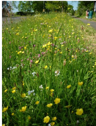
Wild flower bank in Bourton

In the neighbouring village of Bourton, the Wildlife and Habitat Group have taken this approach with the long grass bank that runs along the main road with the hopes of creating an extended habitat for wild flowers and pollinating insects. This group has also placed barn owl nest boxes in a number of locations, including one in the Combe at Pen Selwood. If anyone in Pen Selwood wishes to know more, the group is very happy to share ideas.