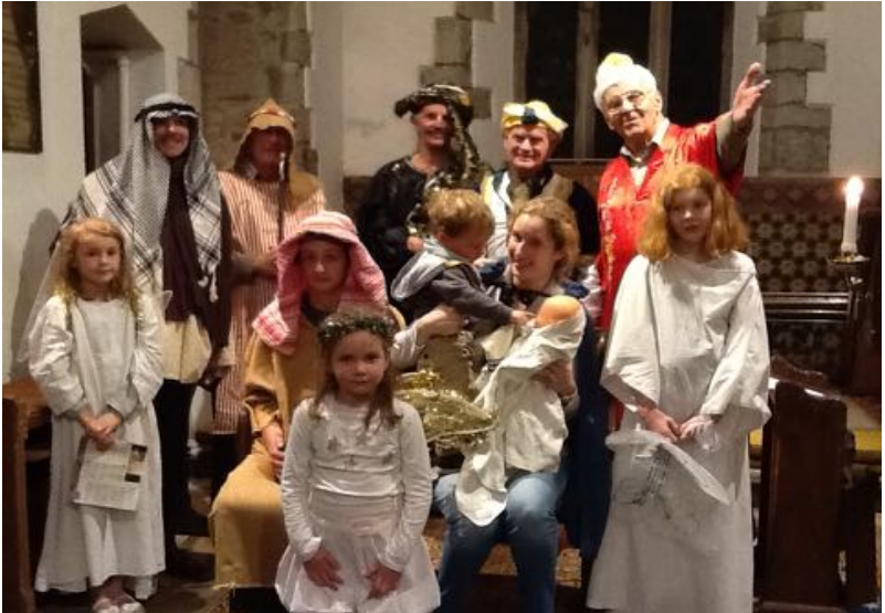
You are never too old to be selected for the Nativity play!