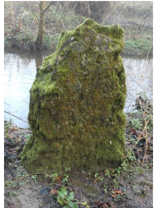
Egbert's Stone (Richard Place)

The format is informal with someone introducing a topic and others contributing what they know. So far we have only just scratched the surface of these topics, we usually leave with more questions than answers! There is an air of excitement in the meetings as people collectively pool what they have found out.