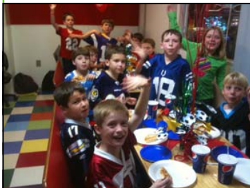
AJ's 10th Birthday Party