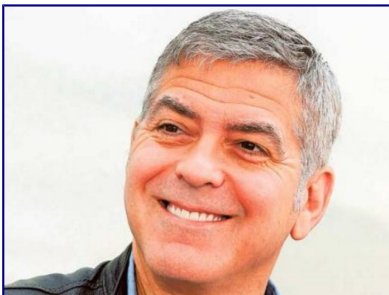
George Clooney: Accused by Swedish medical group of promoting child murder videos

Actor George Clooney knew that the organization Swedish Doctors for Human Rights had cited the “White Helmets” as child killers when he produced the Oscar winning propaganda video that may well have led to this latest outrage. The organization, SWEDHR is very real, their work authoritative and their indictment of the White Helmets for killing children in order to stage propaganda videos would have been known to Clooney and Netflix. They went ahead anyway. Why?