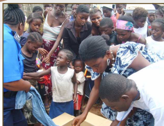
Distribution of large consignment of relief items from Taiwan to the poor and disadvantaged people