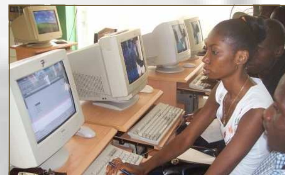
AID beneficiaries in a computer training session