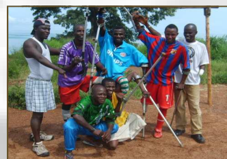
Working with the physically challenged and their families.