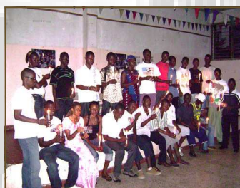
Joining partners around the world in commemorating the International AIDS Candlelight Memorial