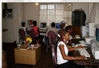
Empowering youths through Computer Training programmes