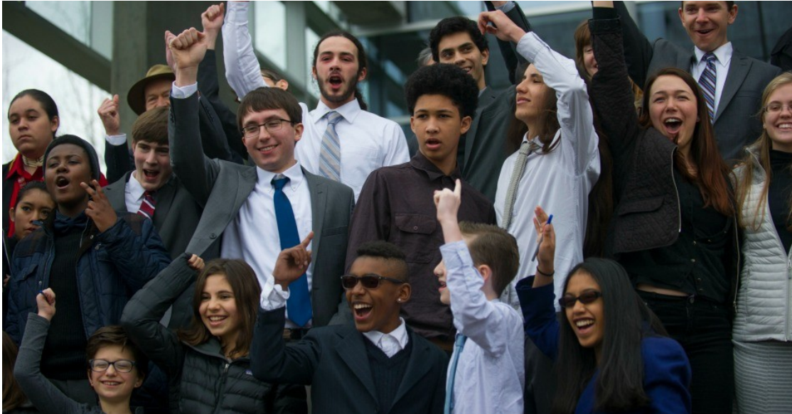
The plaintiffs celebrate after Friday's ruling.

http://www.commondreams.org/news/2016/04/09/unprecedented-youth-climate-case-against-government-moves-forward