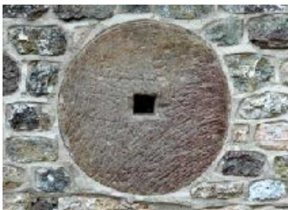
A millstone as a feature on a wall

Some pits were excavated in 1995 during surveying for the Codford-Ilchester water pipeline on the Zeals side of the Stour river, confirming the earlier excavation by Pitt Rivers. The pits are shear sided rather than bowl shaped and infilled with Greensand rubble. A millstone rough-out approximately 90 centimetres in diameter was recovered. Pottery found was limited to post-Medieval.