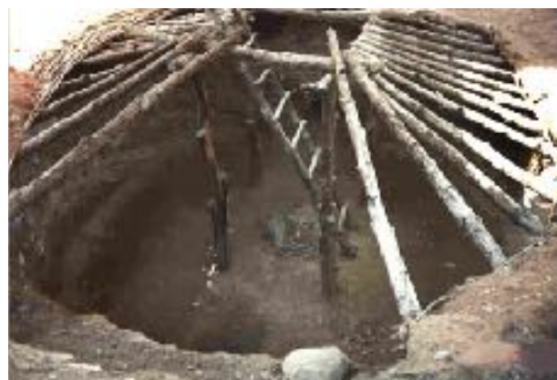
Reconstruction of a pit dwelling