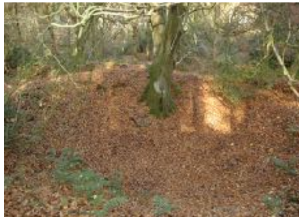
Pits in Penselwood