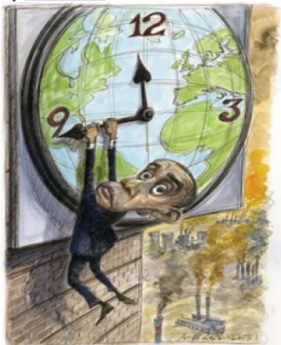
Obama's Climate Challenge