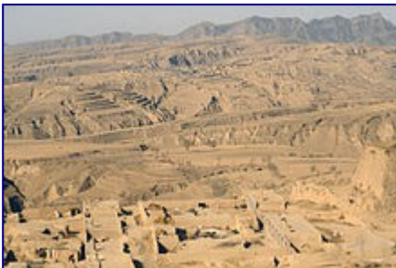
The Loess Plateau near Hunyuan in Shanxi Province .