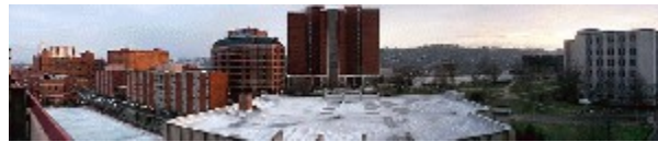
Duquesne Panorama