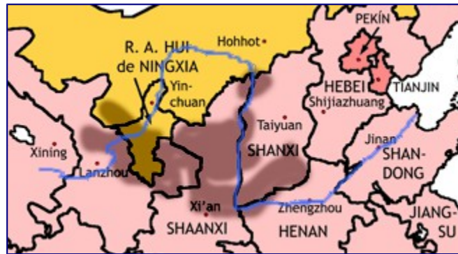
The Loess Plateau is shaded.

The Loess Plateau ( simplified Chinese : 黄土高原; traditional Chinese : 黃土高原; pinyin : Huángtǔ Gāoyuán ), also known as the Huangtu Plateau , is a plateau that covers an area of some 640,000 km 2 in the upper and middle reaches of China's Yellow River . Loess is the name for the silty sediment that has been deposited by wind storms on the plateau over the ages. Loess is a highly erosion-prone soil that is susceptible to the forces of wind and water; in fact, the soil of this region has been called the "most highly erodible soil on earth". [1] The Loess Plateau and its dusty soil cover almost all of Shanxi and Shaanxi provinces, as well as parts of Gansu province, the Ningxia Hui Autonomous Region , and the Inner Mongolia Autonomous Region.