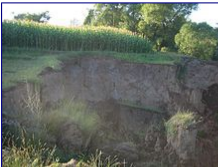
Erosion gradually deprives a corn farmer of his land. ( Linxia City , Gansu)

In ancient times, some of the earliest recorded mention of this area is from travel along the Northern Silk Road . [2] In the last part of the first millennium BC , after the explorer Zhang Qian 's return to China, the Han Dynasty pushed the Xiongnu back and trade and cultural exchange flourished along the