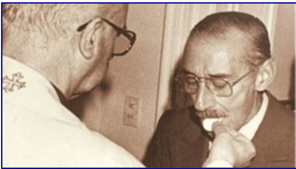
Holy Communion for the Dictators ( image right: