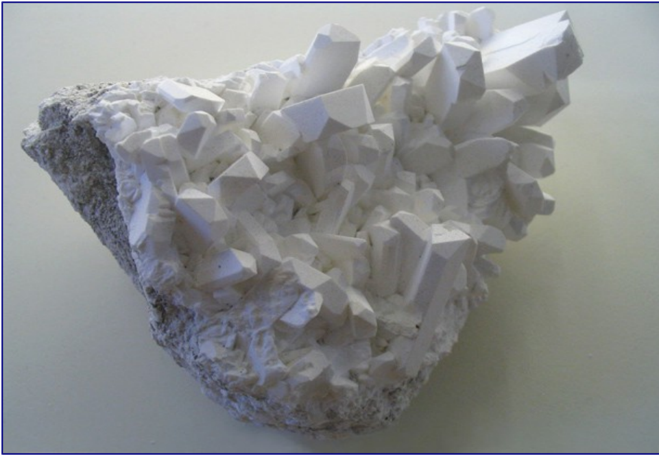
Borax crystals, which contain the element boron.

The second group of minerals that come into play involve those that contain molybdate, a compound that consists of molybdenum and oxygen. Molybdenum, more famous for its conspiratorial relation to the Douglas Adams classic A Hitchhiker's Guide to the Galaxy than for its other properties, is crucial, because it takes the carbohydrates that borate stabilized, bonds to them and catalyzes a reaction which rearranges them into ribose : the R in RNA.