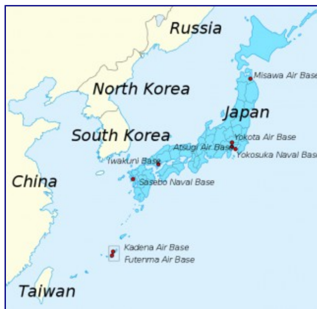
US military bases in Japan

The new North Korean regime wants to unify with South Korea and are offering the South Koreans economic control in exchange for North Korean political control. The South Koreans are offering a ceremonial role to Kim Jon-un.