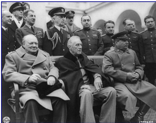
Roosevelt in very frail condition at Yalta

The regime in North Korea thus closely resembles the war time government of Japan with the main difference being the God King is named Kim and not Hirohito. Remember, what is North Korea now was part of Japan or under Japanese influence from the late 19th century until the middle of the 20th century.