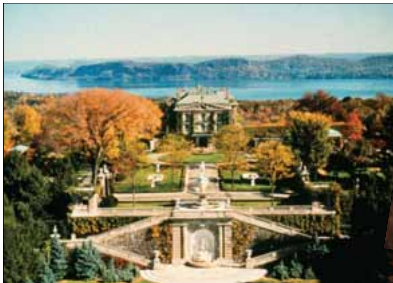
Kykuit, Sleepy Hollow