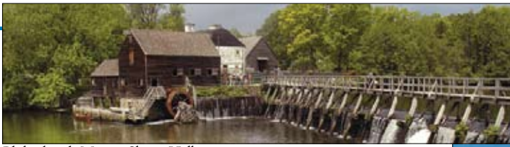
Philipsburgh Manor, Sleepy Hollow