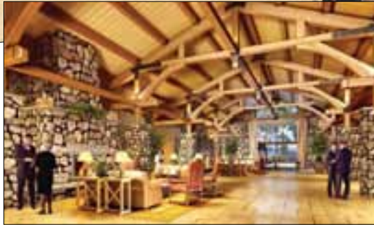
Doubletree Hotel, Tarrytown