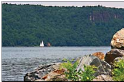
Hudson River View