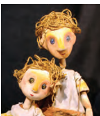
Hansel & Gretel