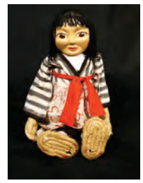
Kiku from Paper Tiger