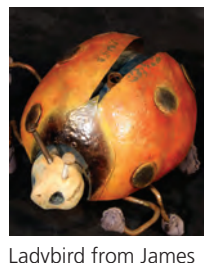
Ladybird from James & the Giant Peach