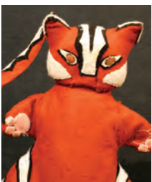
The 'Mystery' Cat

So apply for your adoption papers today!