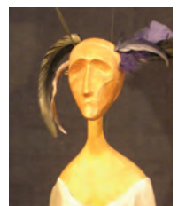
Spirit of Unhappiness