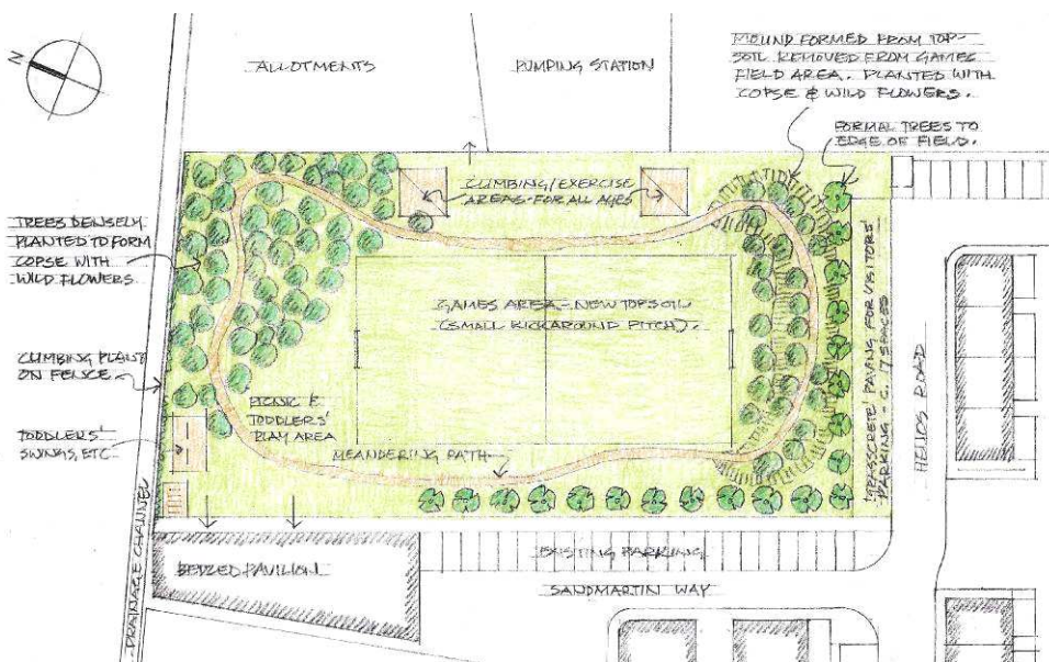
BedZED Pavilion: The Field Possible Layout, incorporating suggestions to Sept 08

As well as an exhibition of photos from the past eighteen months, there were refreshments and a chance to make suggestions for future developments, particularly relating to the development of the field as an amenity for the community. This illustration draws together the suggestions to date.