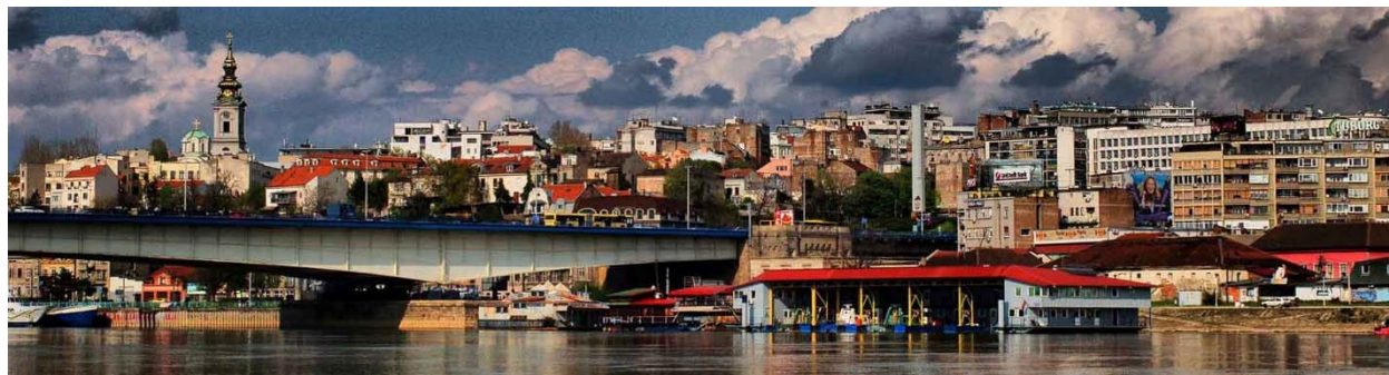
Belgrade, view from the River Sava

If you are interested to know more and to participate please visit our web page EASTER TOGETHER and you will all info about Registration Process and Fee, Participation Fee and other information about Workshop, Stay in Serbia, Visa Procedure and so on.