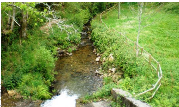
A community access High Conservation Value Forest.

Partnerships were also established: SATIVA (SA Woodmark Mediterranean Programme) carried out a participatory pre-assessment during which members learnt to assess and improve their own levels of compliance, and later led a study tour to the UK to visit several already FSC-certified group schemes to discuss organisational models with other group managers; a Portuguese forest company, SILVICAIMA (SA-FM/COC-1512), introduced the Proforest HCVF Toolkit to the group and provided initial training on how this methodology was implemented for their own certification and how it could be adapted to FLOPEN's situation.