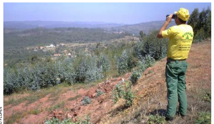
One of the programmes set up by FLOPEN combats the dangers of forest fires.

In conjunction with SA Woodmark, the certification body, it was decided that certification should be achieved at the group level (allowed under FSC-STD-20-007, section 3.3.5 for groups of SLIMFs). Group structure was based on the already close collaboration between the group Manager (FLOPEN) and members. FLOPEN inventoried and mapped all members’ properties to gather the baseline data for management planning. Management options were then discussed with and defined by the members, according to their objectives.