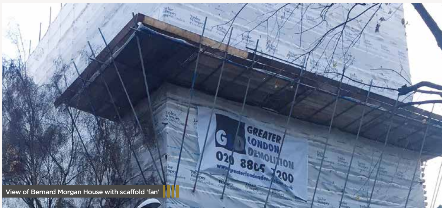
View of Bernard Morgan House with scaffold 'fan'