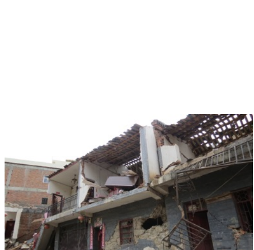
The building above was a 3 story building the 2nd floor pancaked crushing the neighbors new 3000 rabbit farm. IDRN workers deliver relief supplies to the families.