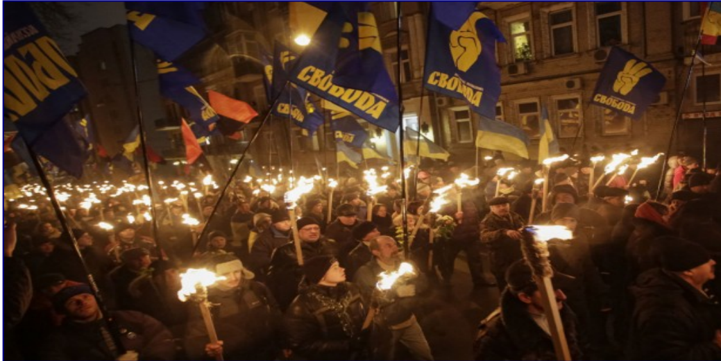
Members of the Ukrainian ultra-nationalist Svoboda Party rally in Kiev

For weeks, the US-backed regime in Kiev has been committing atrocities against its own citizens in southeastern Ukraine, regions heavily populated by Russian-speaking Ukrainians and ethnic Russians. While victimizing a growing number of innocent people, including children, and degrading America's reputation, these military assaults on cities, captured on video, are generating pressure in Russia on President Vladimir Putin to "save our compatriots."