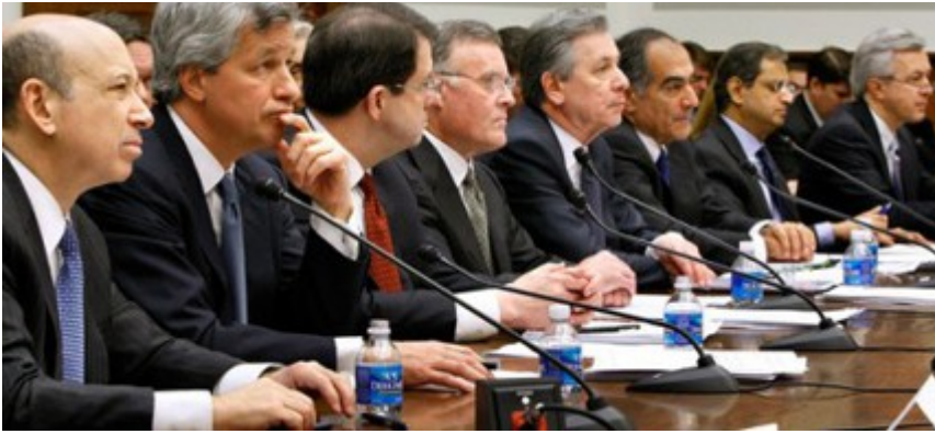
Why are these men not in jail?