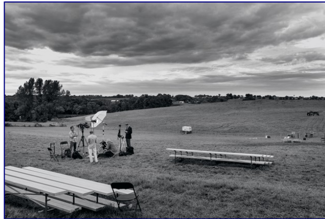
A TV reporter at the Harkin Steak Fry, an annual fund-raiser hosted by Iowa Senator Tom Harkin, in Indianola, Iowa, 2014

food. The big picture, however, is depressingly easy to paint. American agriculture is corn, soybeans, wheat, and hay — four crops that account for 85 percent of the nation’s farmable land. In Iowa, corn and soybeans cover 23 million of the state’s 24 million acres of cropland. One presidential candidate has a literally visceral understanding of the health implications of this fact. Jeb Bush slimmed down substantially before hitting the campaign trail by adopting the popular paleo diet, which can perhaps best be defined as avoiding any of the food that Iowa produces. Yet he doesn’t talk about his personal and quite correct understanding of the country’s fundamental nutrition problem. Instead he ate a deep-fried Snickers bar at the Iowa State Fair, a ritual display of self-flagellation that has become necessary in a state where about a third of the people are obese.