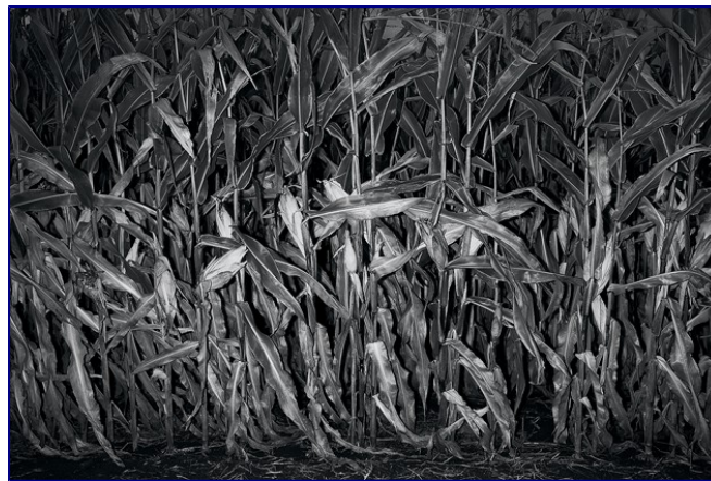
Cornfield near Indianola, Iowa.

While the man and the rest of the crowd looked on, Trump moved quickly from the pandering particulars to his generic stump speech, about a terrifying trip to the border ("My wife came home, and she was crying") and murderous Mexican immigrants ("Such a big problem, and nobody wants to talk about it"). If Trump recognized the connection between the corn he wanted to grab and the immigrants he wanted to send home at Mexico's expense, he didn't acknowledge it. But I'd guess that nearly every person in that auditorium understood the contradiction: corn is America's largest crop, Iowa grows more of it than any other state, and Iowa's agribusiness depends on the Latino laborers who fill the towns that the Midwest calls "little Mexicos," one of which was just twenty-five miles from where Trump was speaking.