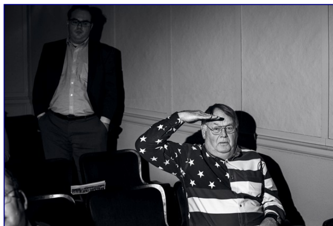
Audience members at the Iowa Freedom Summit, hosted by Iowa Congressman Steve King and Citizens United, Des Moines, Iowa, 2015

"We have had death threats," he says. "We're the 'radicals.' We're the 'revolutionaries' who are declaring war on rural Iowa. In reality we are protecting public health, and we're protecting the economic viability of our consumers."