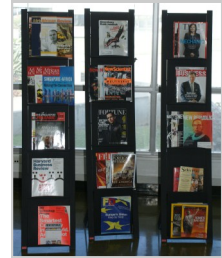
On display at the ECA library's newsstand, new issues of recent magazines

LibAlerts is a newsletter produced by the ECA Knowledge Services Section aimed at keeping you informed about what is new in the Library. In New Books in the Library , we focus on the collection of e-resources that are readily available online at World Bank e-Library , Oxford Scholarship Online or the Directory of Open Access Books . In Africa on the Net , we provide resources that have been found using the ASKIA portal—a search interface developed by ECA to provide Access to Scientific and Socioeconomic Information in, on and from Africa (ASKIA). A search in ASKIA returns results from multiple knowledge bases, compares the results with real-time intelligent clustering of key words and provides the results in a single view. This ASKIA initiative defines a framework for bringing together scientific and socio-economic information for the African research community. Should you have any queries about this publication or about any of the links within, kindly contact us at libservice@uneca.org . Thank you, we look forward to receiving your feedback regarding this issue of LibAlerts !