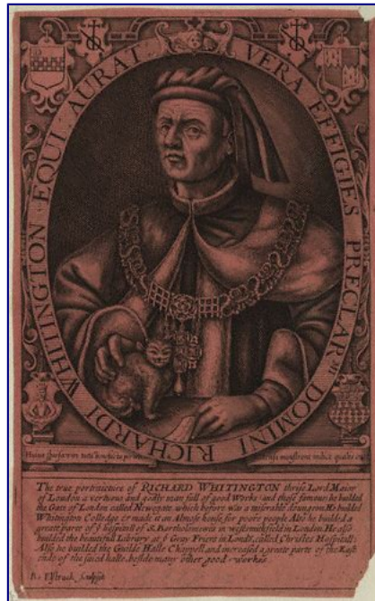
Vera Effigies or "True Portraiture" of Richard Whittington, engraving by Reginald Elstrack (1570 – after 1625).

Original engraving depicted a skull under his palm, but printseller Peter Stent requested it changed to a cat, to meet popular expectations.