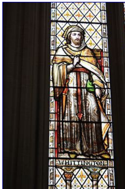
Dick Whittington as portrayed in the stained glass of the Guildhall in London