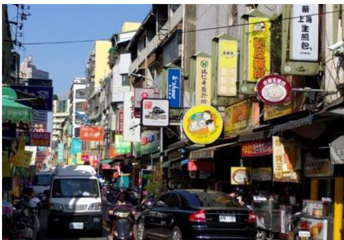
Street scene in Taichung.