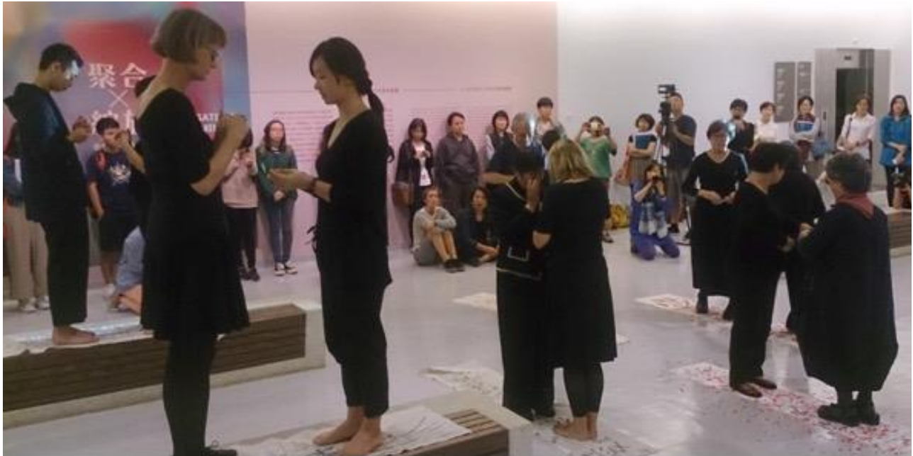
Passing ice during the live performance.

Excitement grew as we watched the audience arrive. Alice then brought us into the performance space one pair at a time. Some performed their duets on top of the benches, while others stayed on the ground, thus creating a two-level spectacle for the audience. The 10-minute performance was professionally filmed and later edited for sharing on the web.