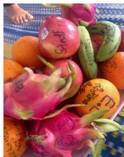
Cambodian fruit with words.

Each new group comes together with a different purpose, so it is always important to make a judgment about which materials to introduce and what people will do with them. A couple of years before our Taiwan trip, Alice had worked in Cambodia with about 45 people for a non-government organisation (NGO) called Epic Arts . The collective aim was very concrete and practical: to come up with a three-year strategic plan. The group encompassed all strata of the organisation (directors, artists, caretakers etc.) and a range of departments (e.g. education, buildings, performance). Readily available materials included teapots,