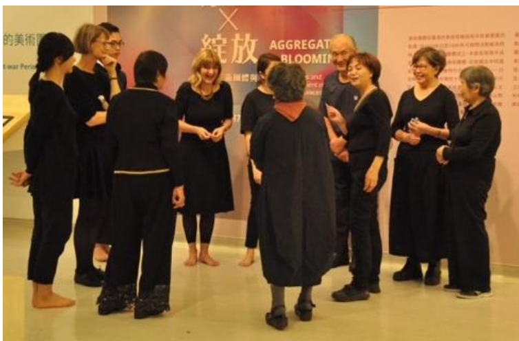
Minutes before the live performance.

We didn't (couldn't!) edit the poem at all but as a piece of writing it was rather lovely. Though some bits sounded sentimental to my ears, others seemed profound (possibly Taoist or Buddhist inspired – for example: "If you have everything you have nothing. If you have nothing you have everything. Everything is nothing, and nothing is everything.")