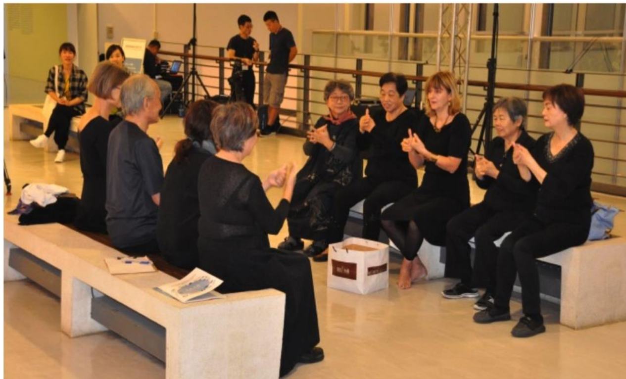
Practising hand movements.