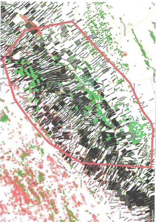
Karnes County, TX