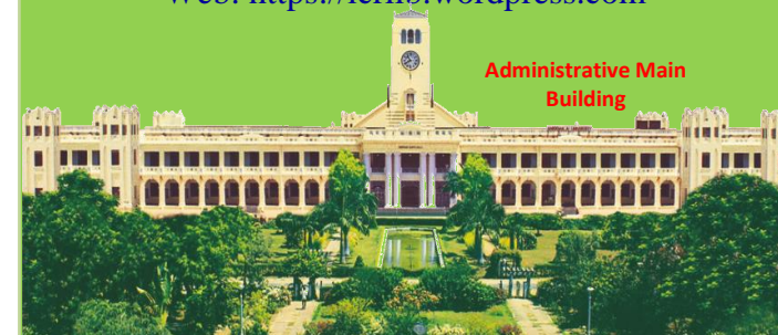
Administrative Main Building

Dept. of Library and Information Science (UGC-SAP-DRS-I Supported) Annamalai University Annamalai Nagar – 608002 Tamil Nadu, India. Email: audlis2018@gmail.com Web: https://icrlib.wordpress.com