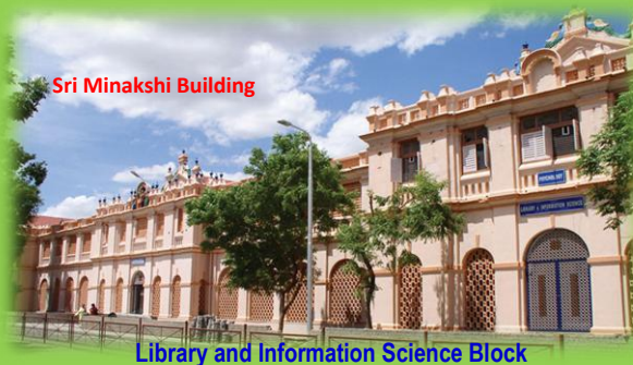
Sri Minakshi Building