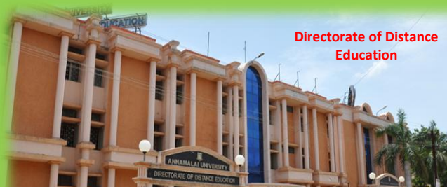
Directorate of Distance Education

ANNAMALAI UNIVERSITY (Accredited with “A” Grade by NAAC)