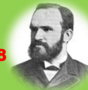
Melvil Dewey (1851-1931)