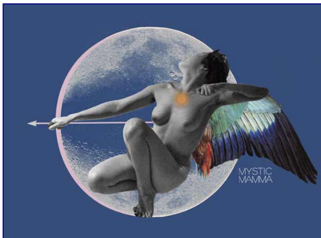
ART BY MYSTIC MAMMA

http://www.mysticmamma.com/full-moon-blue-moon-in-sagittarius-may-21st-2016/