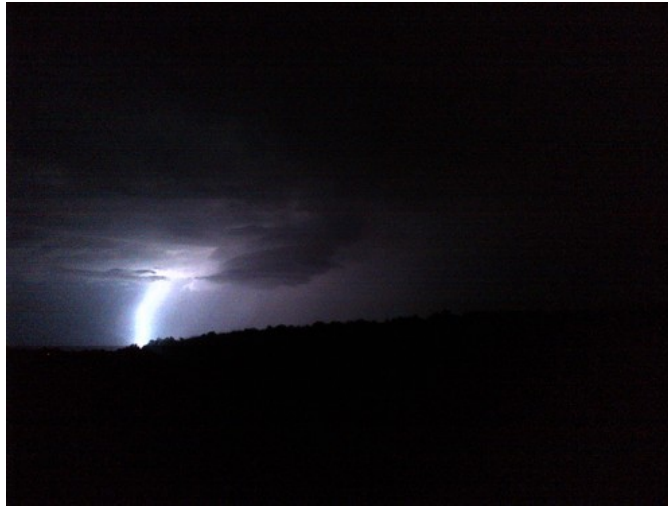
"SHAFT OF LIGHTNING" FROM WISE OWL CARO