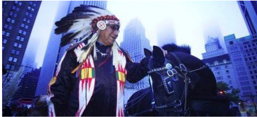
Chief Arvol Looking Horse.