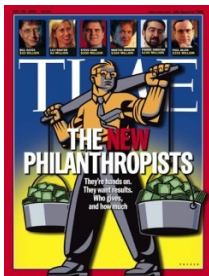
TIME Magazine Cover: The New Philanthropists — July 24, 2000

These captains of banking and industry — who sell themselves off as “philanthropists” as though they were fulfilling the role of divine apostles sent to save the world from itself — do not believe in competition.