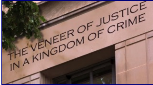
The veneer of justice in a kingdom of crime