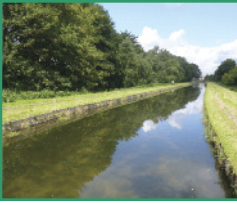
New River Walk near Wightman Road