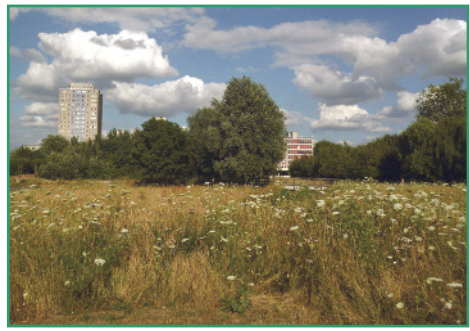
Broadwater Farm Estate glimpsed across the meadows in Lordship Rec

The trail showcases 16 trees on a mile long route through the park. A