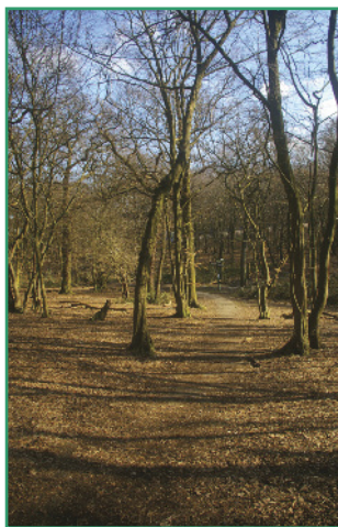
Winter in Coldfall Wood

Buses: 102 and 234 or any bus to Muswell Hill Broadway and walk W7, 144, 134, 43