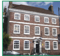
Grade II* listed Dial House, 790 High Road. Built in 1691 for Moses Trulock, a city soap manufacturer. Owned by the Trulock family until the 1830s.

Saturday 1st October. Meet at 11am at Bennetts Close, N17 OHD, cul-de-sac near junction of Tottenham High Road and Northumberland Park (opposite the big new Sainsbury's).