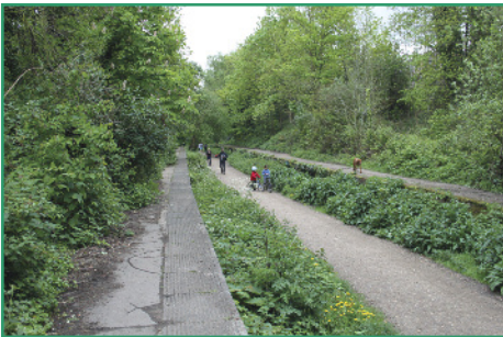
The old railway platforms on Parkland Walk, near Crouch Hill.

Saturday 1st October. Meet at 10.30am at Wells Terrace Bus Station (210, W3 & W7) behind Finsbury Park Station.