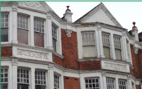
St. James's Parade, Muswell Hill.

Who lived in Denmark Terrace? Why is the Odeon entrance at an