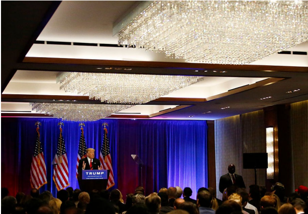
Trump speaks at Trump Soho, built in partnership with Bayrock

http://www.dailykos.com/story/2017/1/9/1618540/-Was-Donald-Trump-bailed-out-of-bankruptcy-by-Russia-crime-bosses?