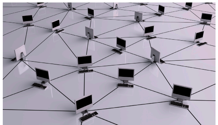
Visit the MAPP Network to meet fellow MAPP users.

The September 2005 edition of the Journal of Public Health Management and Practice focused on MAPP. This issue addresses issues related to implementing MAPP and the NPHPSP local instrument. Order copies at www.naccho.org/topics/infrastructure/mapp/framework/research.cfm .