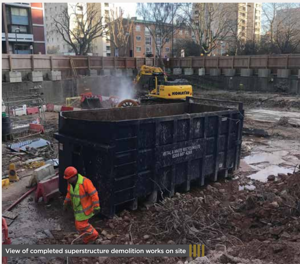
View of completed superstructure demolition works on site