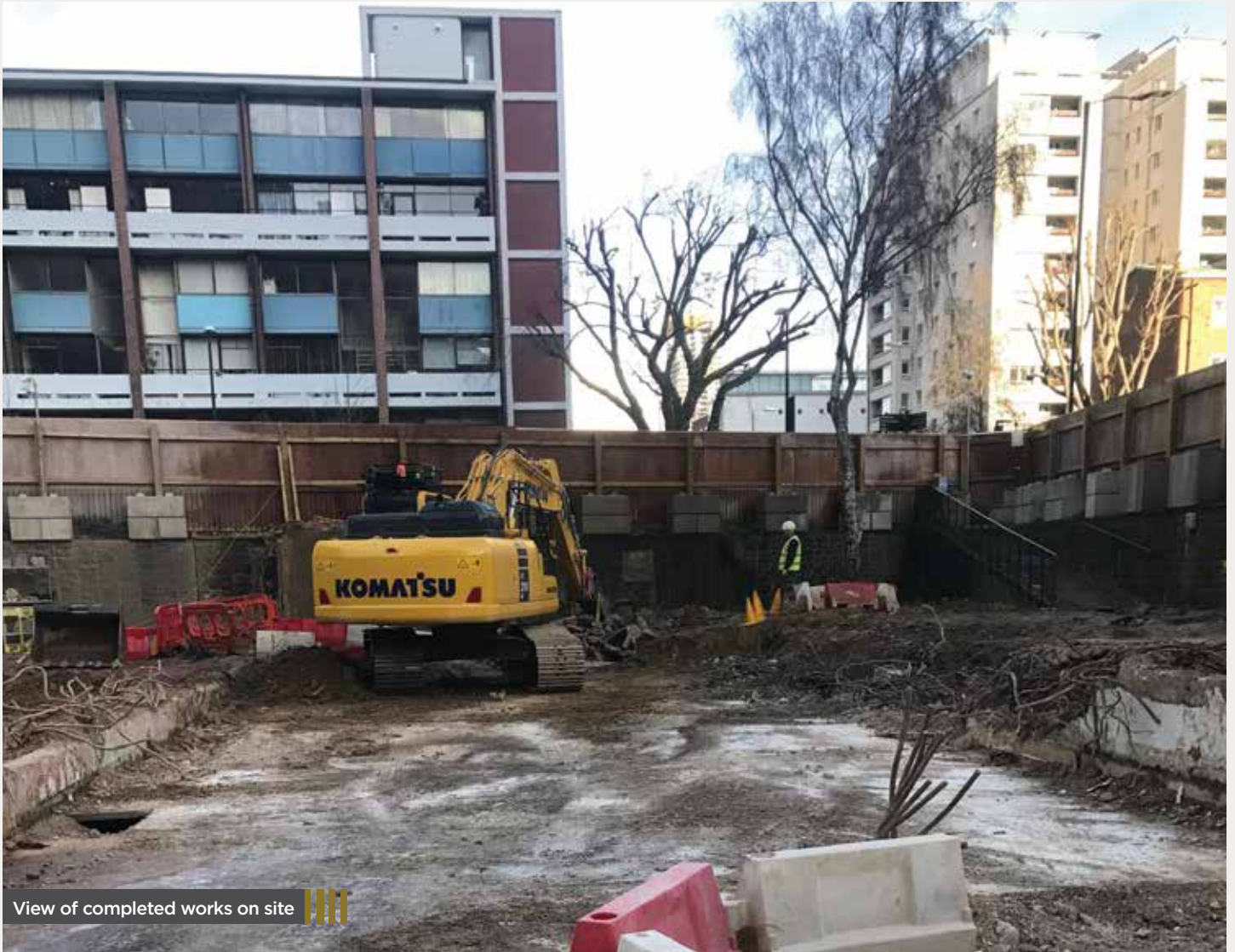
View of completed works on site