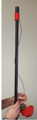
Figure 3: V-Map Air mounted on a Survey Rod

For typical 'walk and stop' terrestrial point by point surveys, V-Map Air can be mounted on a standard survey rod as shown in Figure 3. In this mode of operation, the surveyor places the tip of the rod on the marker (survey monument, ground control point etc.), centers the bubble on the rod and then takes a picture with the camera before moving on to the next point.