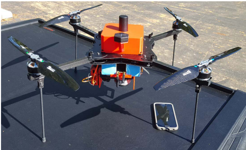
Figure 2: V-Map Air mounted on a small Survey Copter

The V-Map system has been designed to be UAV-independent. It can be used as an air-borne rover, an on-the-pole rover or as a reference station.