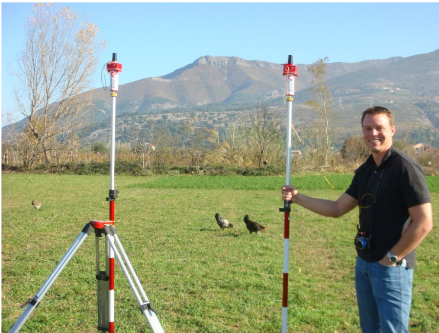
Figure 4: A pair of pole mounted V-Map Systems being employed in a post-processed kinematic survey.

As shown in Figure 4 below, V-Map Air can be used as rover or reference receiver.