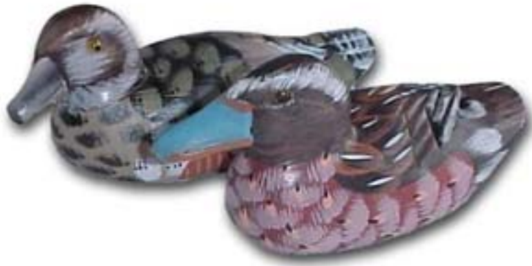
A pair of Mandarin Ducks for love.