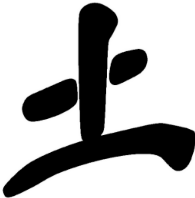
The Feng Shui Element For Earth