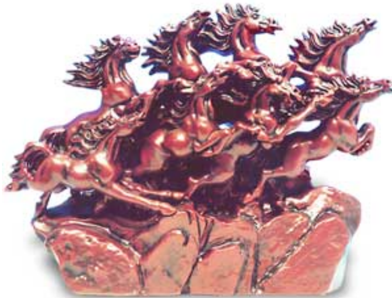
A red lacquer statue of the Eight Horses of Success