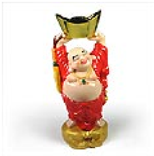
A Buddha holding a Gold Ingot (Wealth Symbol)