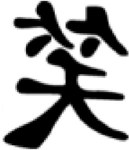
The Feng Shui Symbol for "Smile"