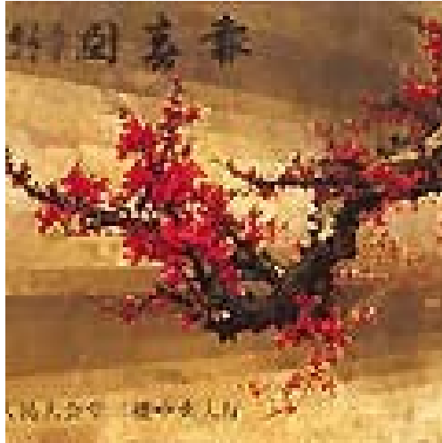
Plum Blossoms represent love in Chinese Art.