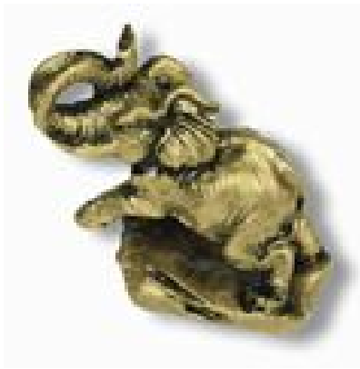
A brass lucky elephant with a raised trunk.