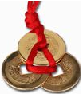
An example of Three Coins Tied With Red Thread

String together 3 I Ching Coins on red thread and place in the wealth sector, or place inside your accounting ledger or near cash register. Three coins knotted together with a blue ribbon to symbolize a sudden windfall. Strings of eight I Ching coins strung together with red thread are also placed near the front door or in the Southeastern (prosperity) corner to enhance wealth.