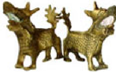
Brass Ki-Lins - The Chinese Unicorn