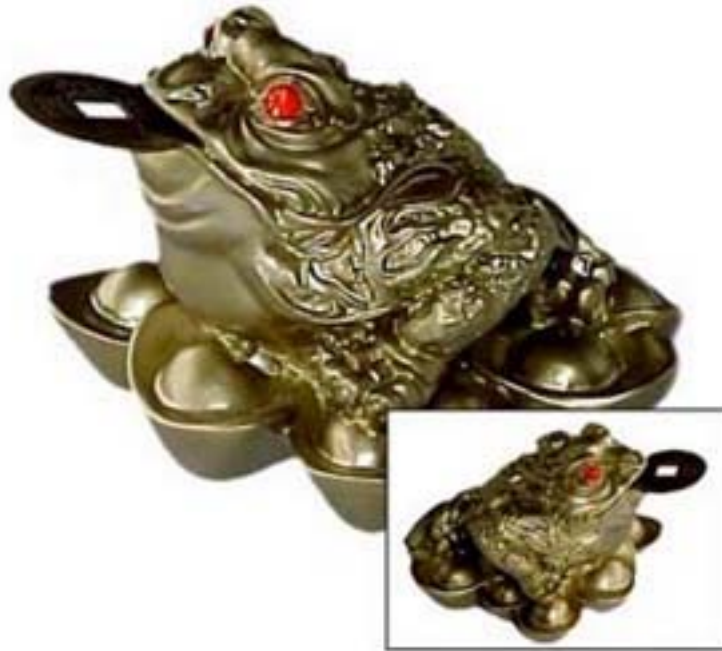
A Three Legged Wealth Frog

cover all of your sources when it comes to inviting money into your house.