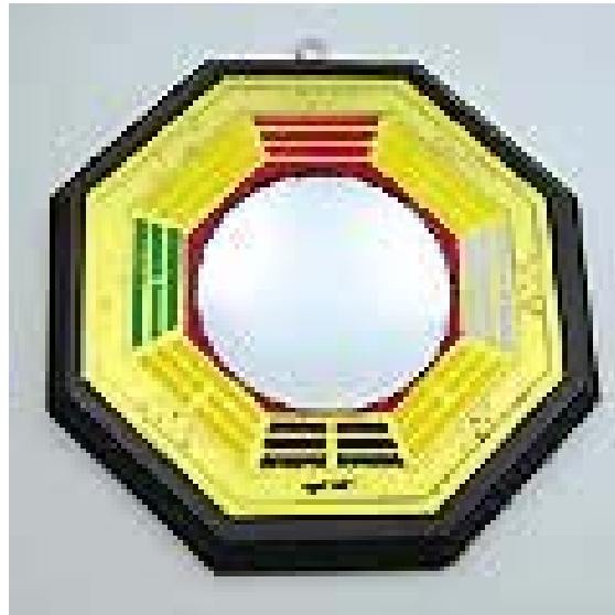
A Protective Bagua Mirror