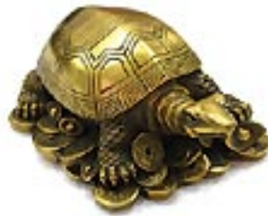
A brass dragon headed turtle

mouth to attract love. Put a gold ribbon in its mouth and place it in the southwestern corner to attract prosperity. To aid health matters place a piece of blue ribbon in the Dragon Turtle's mouth and place in your central health sector. Never place the dragon headed turtle in the kitchen or bathroom as that can cause disruptions in positive chi.