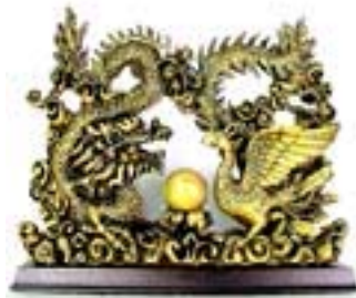
A brass statue of the Dragon and the Phoenix