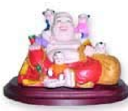
An example of a Buddha With Children