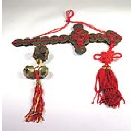
An example of a coin sword