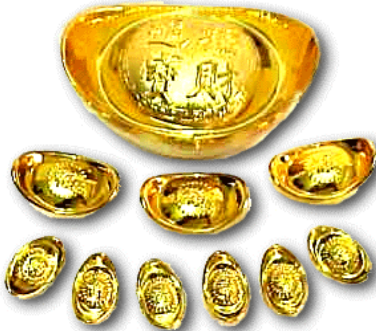
A collection of Chinese Gold Ingots is certainly appropriate for The Southeastern sector!