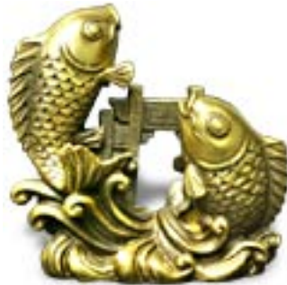
A brass figurine of Double Leaping Carp.