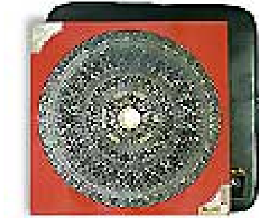
A reproduction of an ancient Feng Shui Compass

draw things to you that consist of a higher vibration such as career opportunities, a healthy lifestyle, mentors, good friends and soul mates.