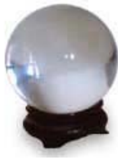
Round Items such as this crystal globe enhance the Creativity Sector