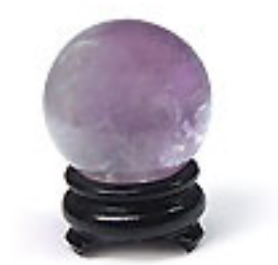
A purple crystal can help enhance prosperity and wisdom areas.