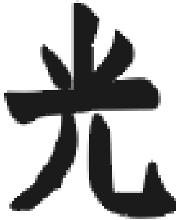
The Feng Shui Symbol for Light

Make it a project to clean up and throw away things you do not use or love, things that are broken, things that are untidy or un-organized, unfinished projects and things that are crammed into too small of a space. Do this in every area of your house and watch everything from you health to your finances to your love life immediately improve!