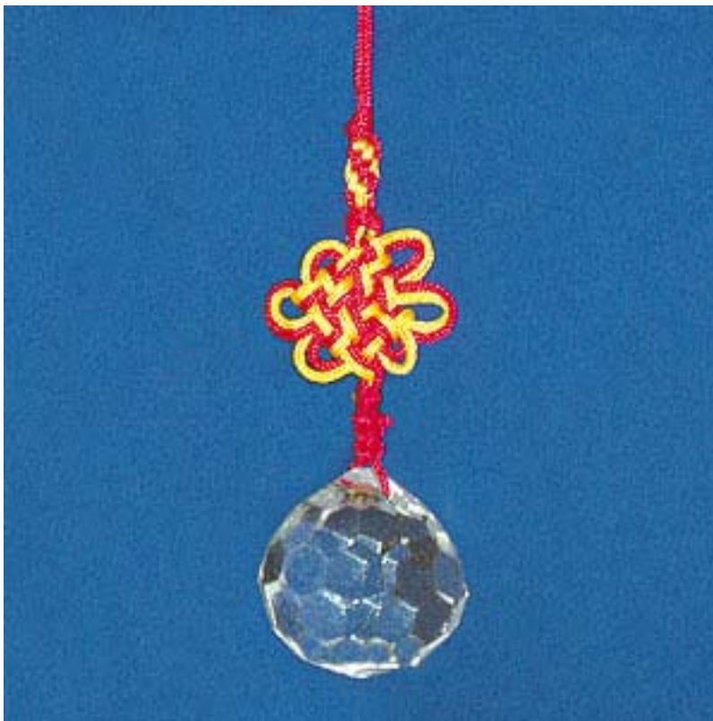
A crystal hung with by a mystical knot that means "chi."