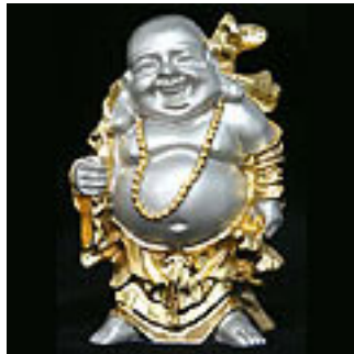
A metal object representing wisdom such as this Laughing Buddha suits the Mentor and Travel area