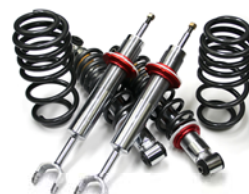
Performance Coil-Over Suspension