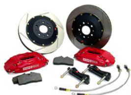
Big Brake Kits