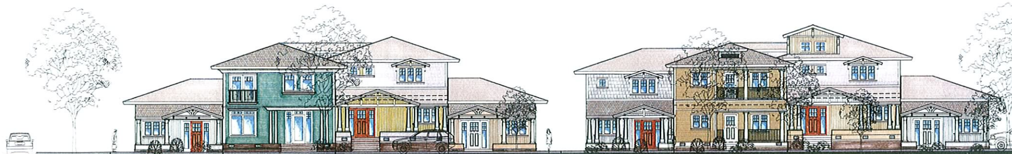
LIME STREET ELEVATION - EAST SIDE, LEFT