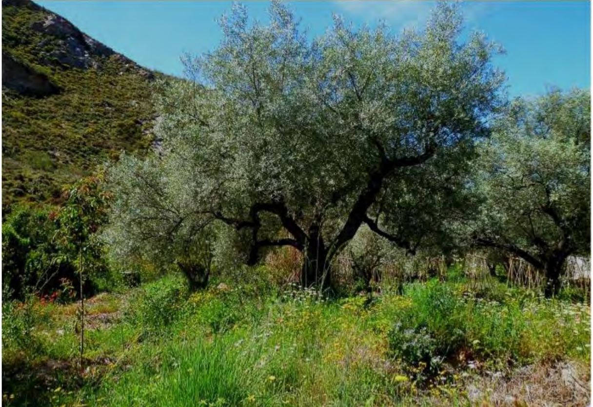
Olive trees.

Eyes closed, they crushed and savoured wild herbs, then walked without talk, soothing the mind's noise and returning to the simplicity of sense,