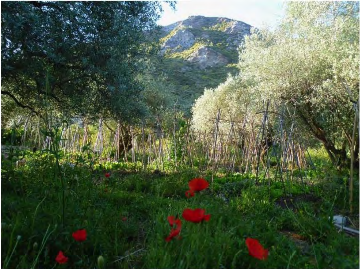
The vegetable garden: Photo: Alison Piasecka