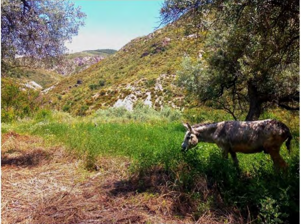
La Burra grazing.

past the olive trees twisting through time and past the tiny settlements of youthful pioneers who had briefly forgotten their mourning donkey and even their destiny.