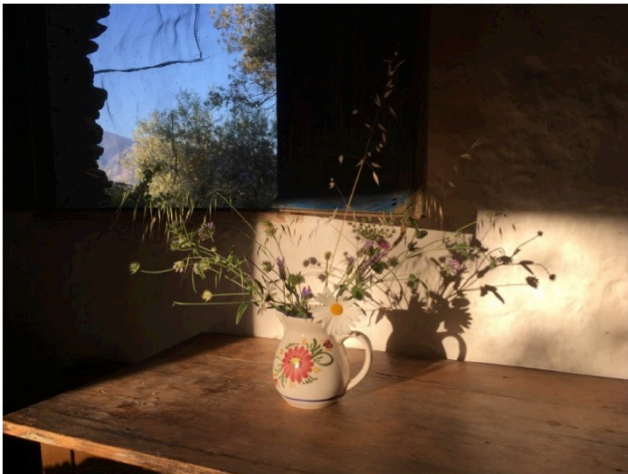
[Early morning, Casa Luna, La Burra Verde.]