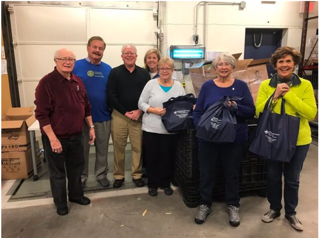
The after-meeting Food Bank crew