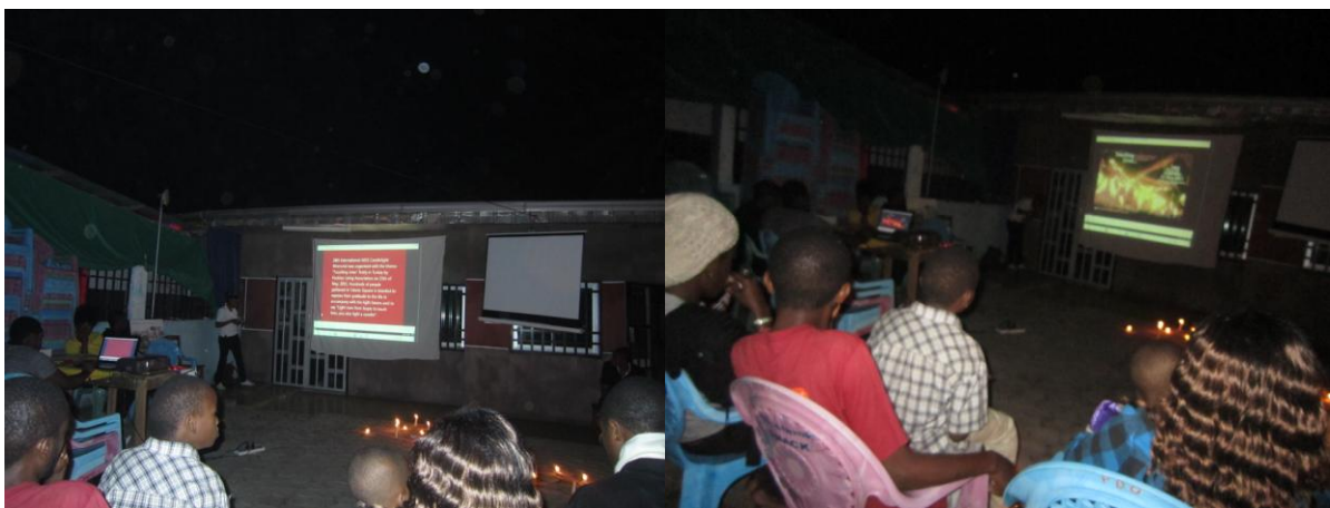
Projections during the event