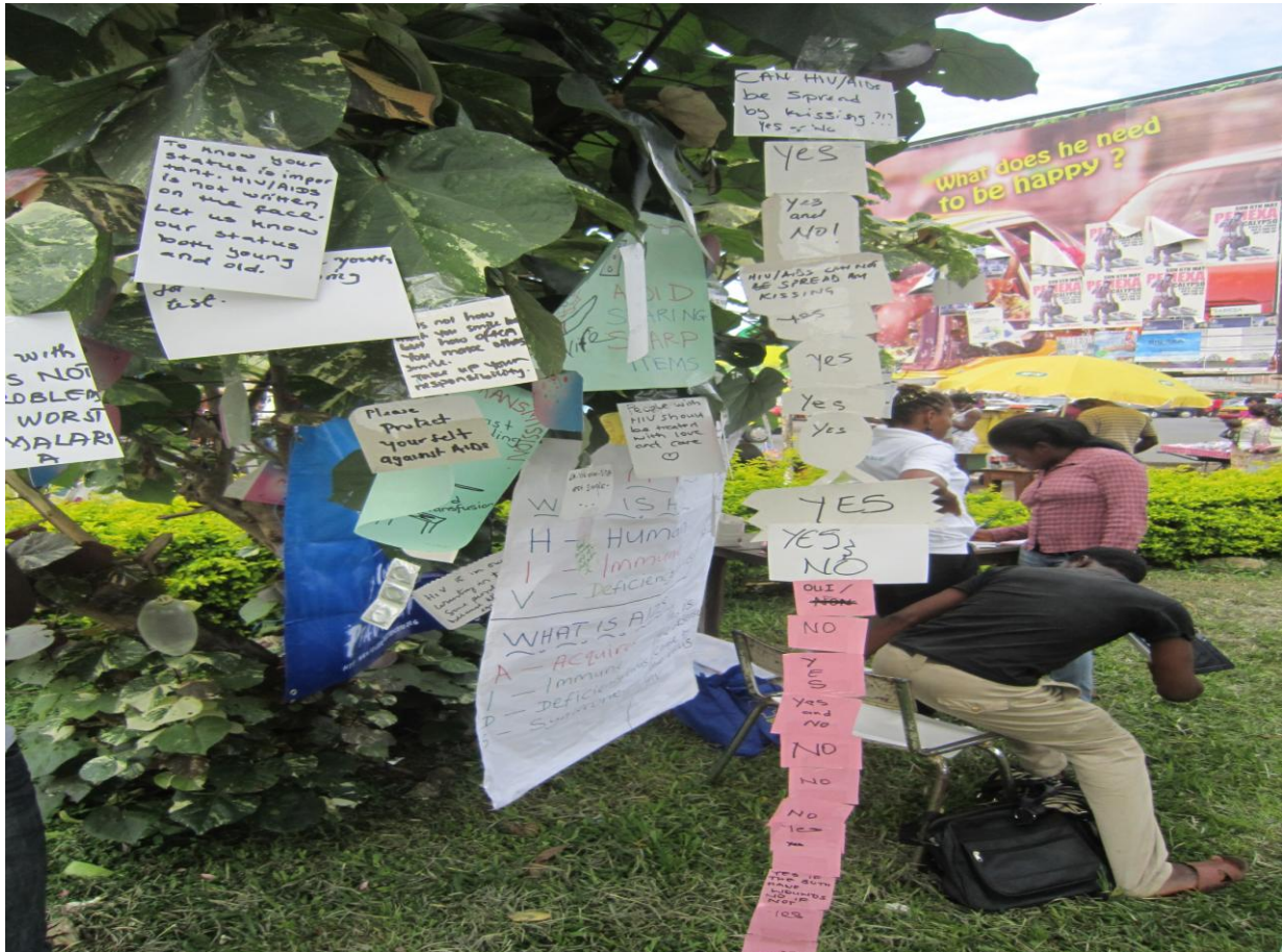
AIDS cafe; what do you think and know about HIV

Turning your Visions into Actions (vision4action@yahoo.com)